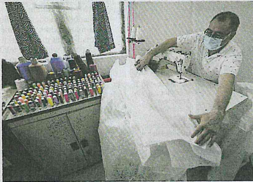
Seorang lelaki Afghanistan sedang menjahit pakaian PPE di sebuah pusat latihan jahitan di Ampang semalam.

"Senarai nama, nombor telefon dan e-mel pegawai bagi setiap negeri telah dimaklumkan bagi membantu kakitangan