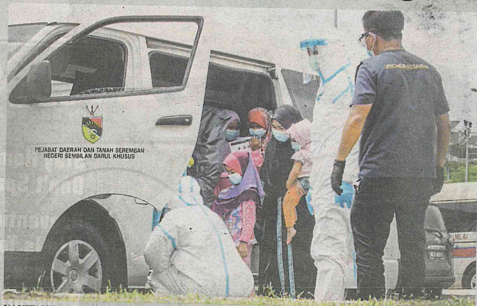
KAKITANGAN Jabatan Kesihatan Daerah Seremban membuat saringan ke atas penduduk Taman Nusari Aman, Bandar Sri Sendayan.

Ujian saringan itu dipercayai bertujuan mengesan individu lain yang mung-