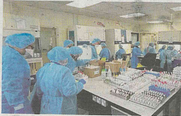
KAKITANGAN JKNS giat menjalankan ujian sampel Covid-19 di makmal.