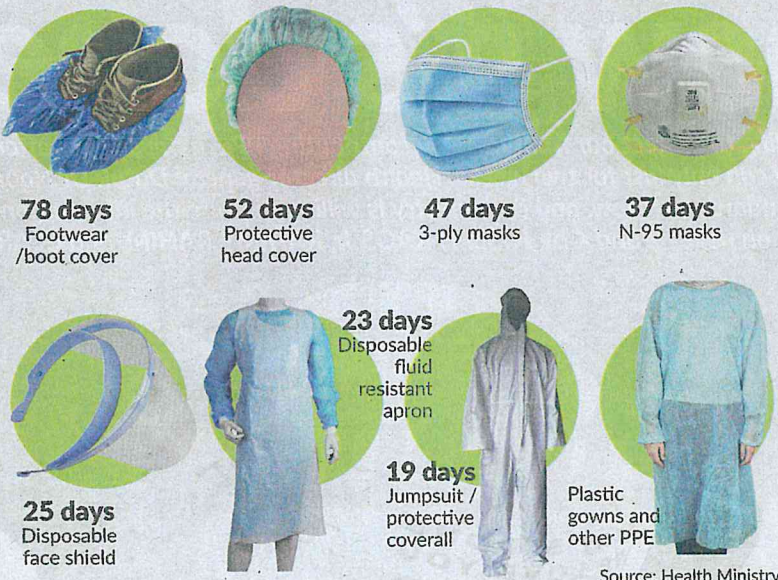
Protective gear used by Covid-19 frontliners Number of days before stock finishes (As of March 14, 2020)