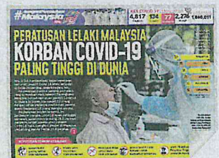
Muka depan akhbar Sinar Harian semalam.

Ia selari dengan kenyataan Pakar Perunding Perubatan dan Paru-paru, Sunway Medical Centre Velocity di