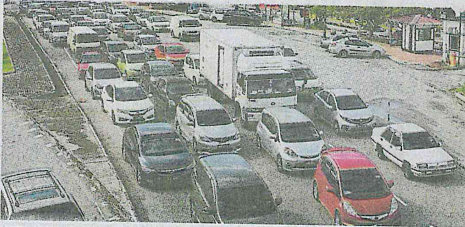
OPERASI PKP di sekitar Bandaraya Seremban menunjukkan pematuhan orang ramai terhadap PKP masih kurang apabila terdapat banyak kenderaan di jalan raya.

dengan masing-masing merekodkan satu kes di sembilan daerah iaitu Baling, Padang Terap, Bandar Bahru dan Sik di Kedah; Raub di Pahang serta Sri Aman, Ma-