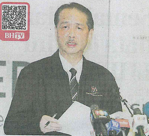
Dr Noor Hisham pada sidang media harian di Putrajaya, semalam.