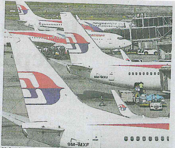
Malaysia Airlines akan menyambung semula operasi penerbangan ke Sabah dan Sarawak dengan kekerapan sekali seminggu. (Foto hiasan)

Malaysia Airlines turut mencatatkan penurunan mendadak jumlah penumpang antara 10 hingga 15 peratus, susulan penu-