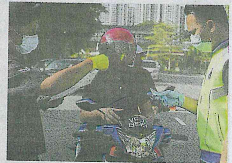
PENGUAT kuasa memeriksa surat kebenaran bekerja daripada majikan daripada pengguna yang memasuki Seremban.

positif Covid-19 melebihi 41 kes, zon jingga (20-40 kes), zon