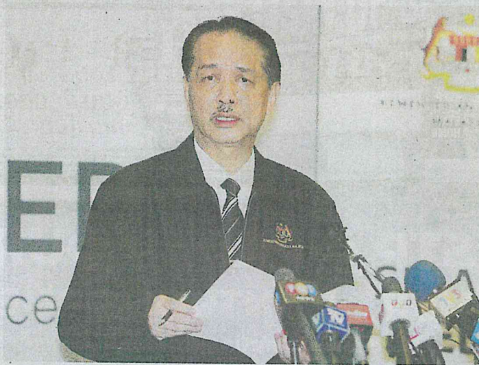
Health director-general Datuk Dr Noor Hisham Abdullah speaking at a press conference in Putrajaya yesterday.

"He tested positive for Covid-19. His cause of death is being investigated by police."