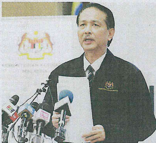
Dr Noor Hisham bercakap pada sidang akhbar harian berkaitan jangkitan Covid-19 di Kementerian Kesihatan, Putrajaya semalam.

"Setelah kes kumulatif ditolak dengan kes discaj dan kematian, jumlah kes aktif dengan